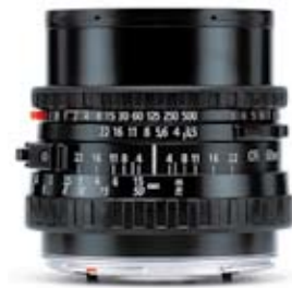
CFi 3.5/60 mm